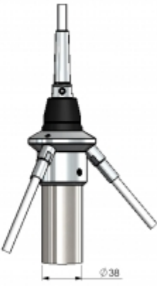
DETAIL A SCALE 1 : 2