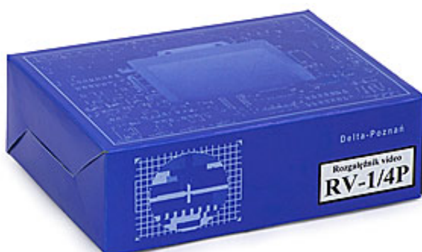
View of the packaging

The multiplexer is mainly designed to work with CCTV cameras. It can split video signal from one camera or