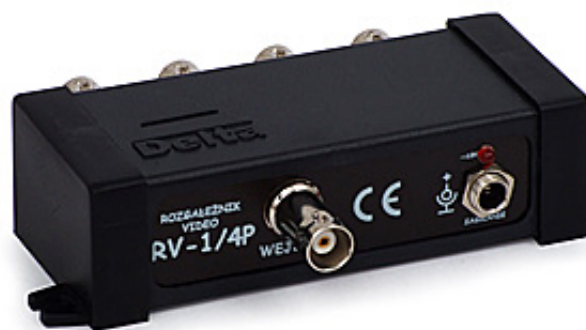
View of the multiplexer.