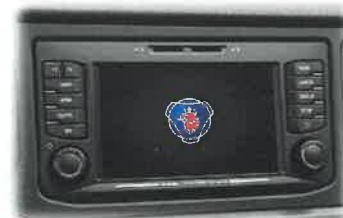
Scania Infotainment Premium

Interface to connect up to 3 pcs MXN camera (with or without motorized shutter) at Scania Infotainment Premium monitor (AUS4).