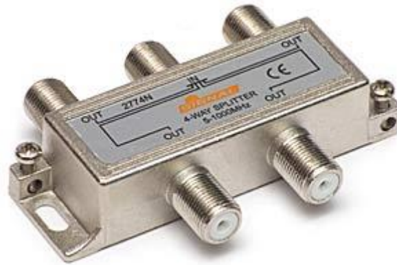
View of the splitter

The splitter is CE certified. Its operating frequency range is 5-1000 MHz and the product represents good, standard parameters within its class. It is equipped with F connectors and cast aluminum housing.